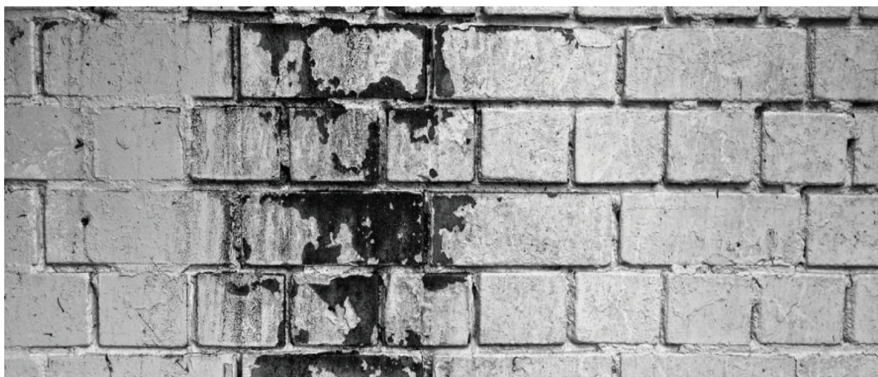
Mold Contamination in a Basement

These Guidelines apply to all buildings or any part of the building where contamination of mold exist and there are persons at work, except domestic building.